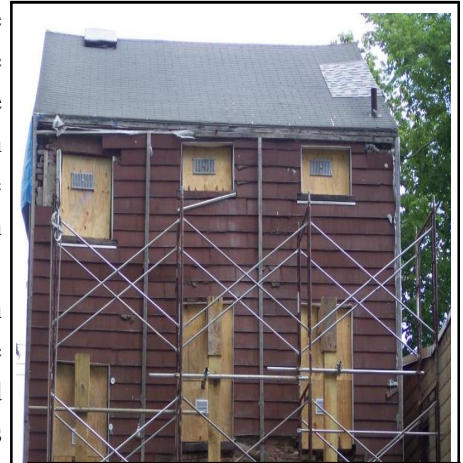
Myers Residence back view - floors 2 and 3 with scaffolding, beam supports, and covered vented window spaces.

As construction moves forward one can expect to find the various recommendations made within the recently completed