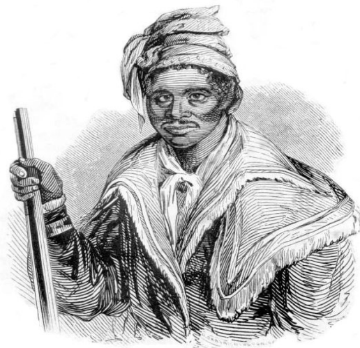
Abraham, a Black Seminole leader from N. Orr's engraving published in 1848 in The Origin, Progress, and Conclusion of the Florida War by John T. Sprague, 1848

government welcomed the Seminoles as a buffer against, and a resource drain on, the rival Anglo-American colonialism. Then in the late 1810s, the US military waged full-scale